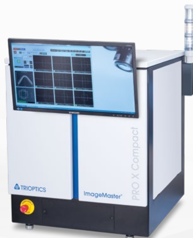
Table top device with front-mounted monitor