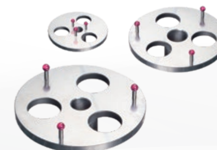
Precision rings with ruby balls for the SpheroCompact®

An additional foot switch is available to activate the measuring process.