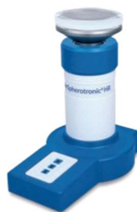
The SuperSpherotronic® HR for measuring the radius of curvature with an accuracy of up to \pm 0.01 %

The stable tabletop devices are easily operated using the buttons built into the base. They move the linear gauge upwards and downwards and start the measuring process. All other settings as well as the output of the measurement results are controlled by the SpheroPRO software.