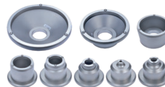
Precision rings with tungsten carbide balls for the SuperSpherotronic® HR and UltraSpherotronic®