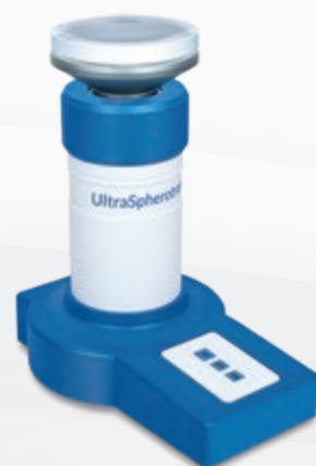
With a precision of \pm 0.005 %, the UltraSpherotronic® is used to calibrate reference samples.