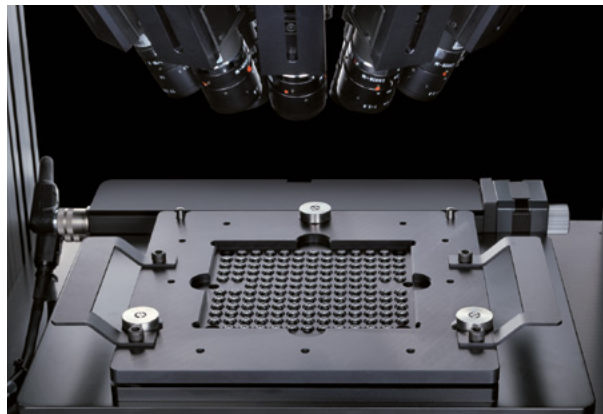
Measurement chamber with up to 27 cameras

The new ImageMaster® PRO 10 also provides additional measurement functions. For example, measurements at different frequencies and RGB measurements can be performed to determine chromatic aberration. An upgrade of four additional cameras allows the measurement of relative illumination for testing the homogeneous illumination of lenses in the field. The exceptional innovations make this MTF production tester ready for future needs and upcoming high resolution megapixel lenses.