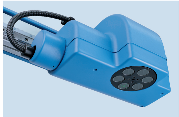
Motorized object generator for finite conjugate systems

With the collimator on the precise swinging arm an ultra-wide field angle up to \pm 105^\circ can be measured for infinity conjugate samples. An upgrade for finite testing can easily be adapted to the system with an additional motorized stage and object generator.