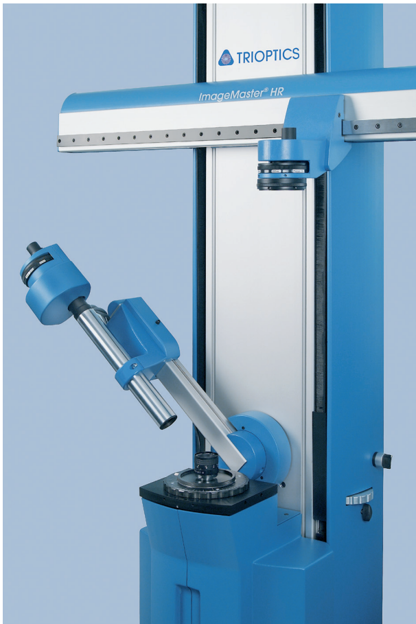
Off-axis measurement with the precise swinging arm

The ImageMaster® HR is a fully equipped R&D quality test station for medium sized sample lenses. Its modular and upgradeable design enables the measurement of the image quality (MTF) and a wide range of other optical parameters for today and future needs. The instrument is used in the R&D laboratory as well as in the quality assurance or in production. The unique vertical setup of the ImageMaster® HR is space saving and ensures the most convenient and accurate positioning of the sample lens mounts. For the majority of lenses this vertical measurement with the gravitational force along the optical axis is advantageous and easy to handle.