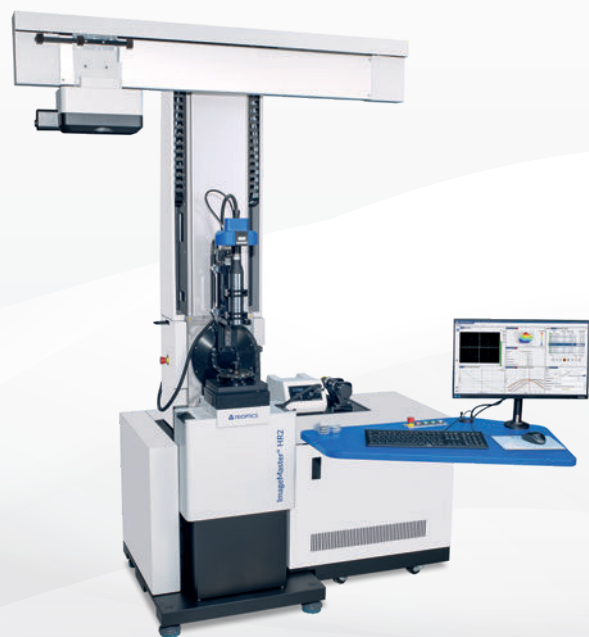
Image quality testing with highest precision and reliability