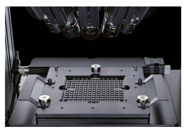
Measurement chamber with up to 27 cameras

The new ImageMaster® PRO 10 also provides additional measurement functions. For example, measurements at different frequencies and RGB measurements can be performed to determine chromatic aberration. An upgrade of four additional cameras allows the measurement of relative illumination for testing the homogeneous illumination of lenses in the field. The exceptional innovations make this MTF production tester ready for future needs and upcoming high resolution megapixel lenses.